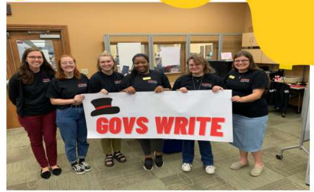
Tutors celebrating the National Day on Writing!