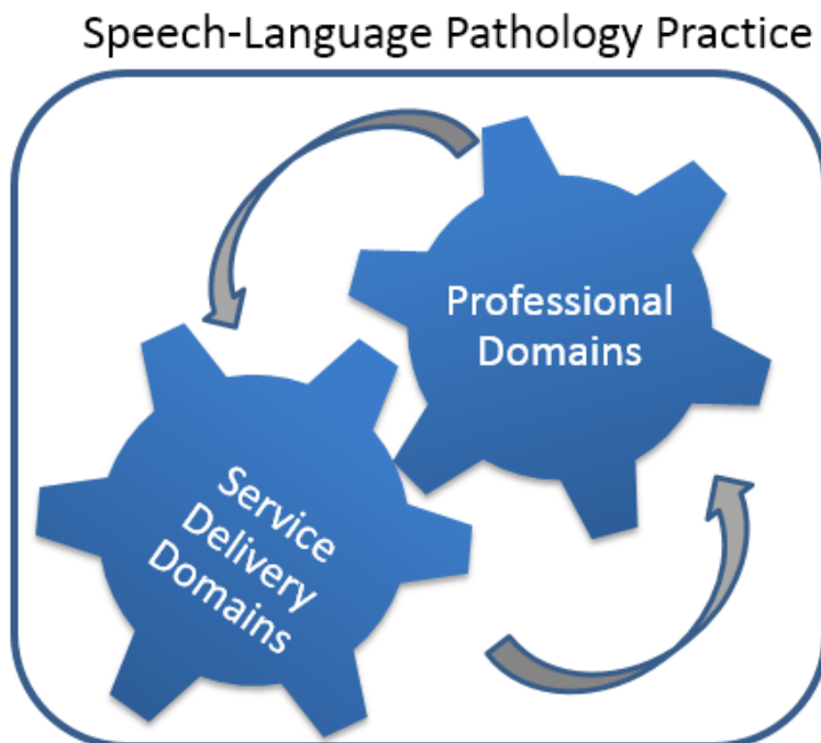
Figure 1. Schematic representation of speech-language pathology practice, including both service delivery and professional domains.